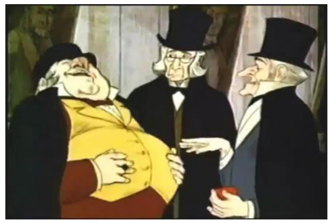
The Ghost showed Scrooge men laughing about a foolish miserly man who recently died. The man was despised by all because of his greed.